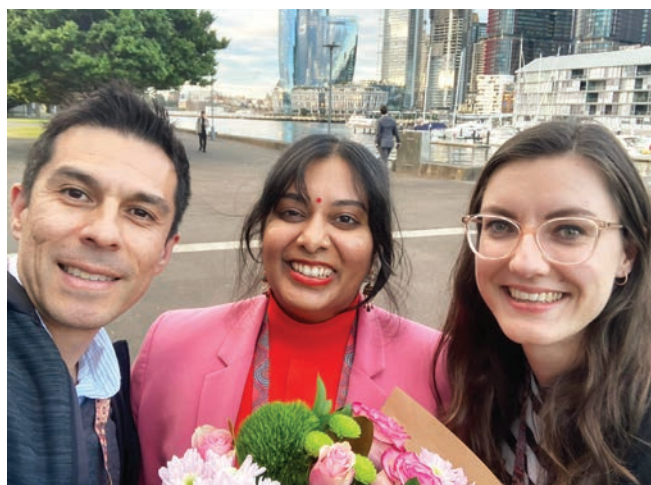
Members of our Financial Abuse team.

Thank you all for the assistance that I have received during this challenging moment of my life. The support, care and professionalism I have experienced from the team has nothing short of extraordinary. Thank you for making me feel human again, that I am not just a number. That I matter and am worthy of your time.