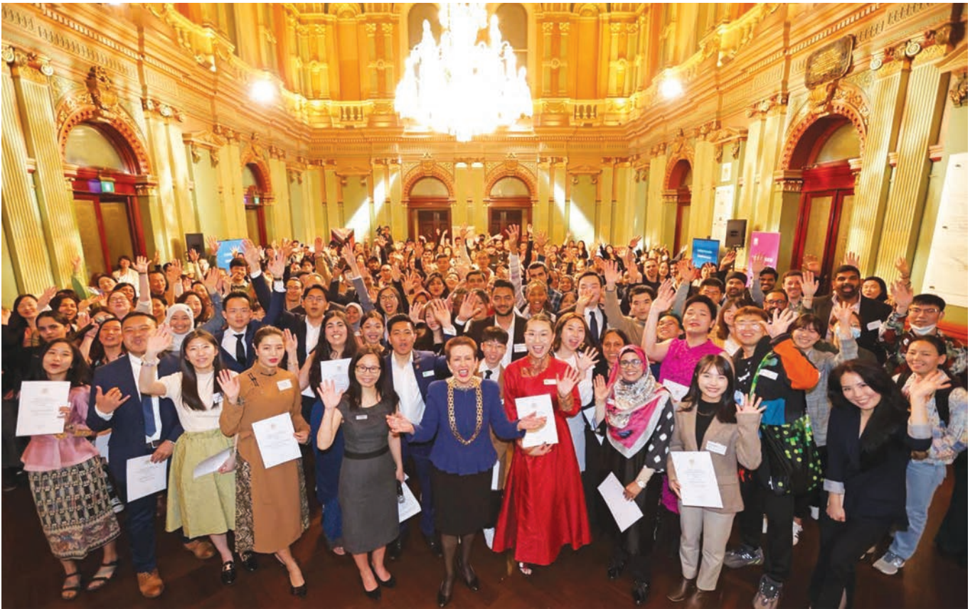
International Students at Lord Mayors Welcome for International Students.