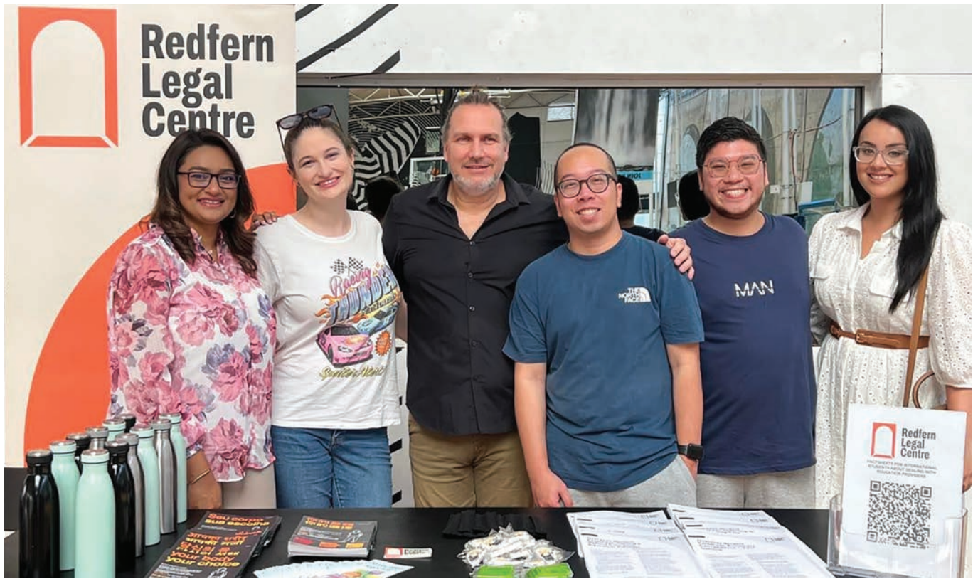
Redfern Legal Centre's International Student Legal Service NSW at the Australia Sports Program.