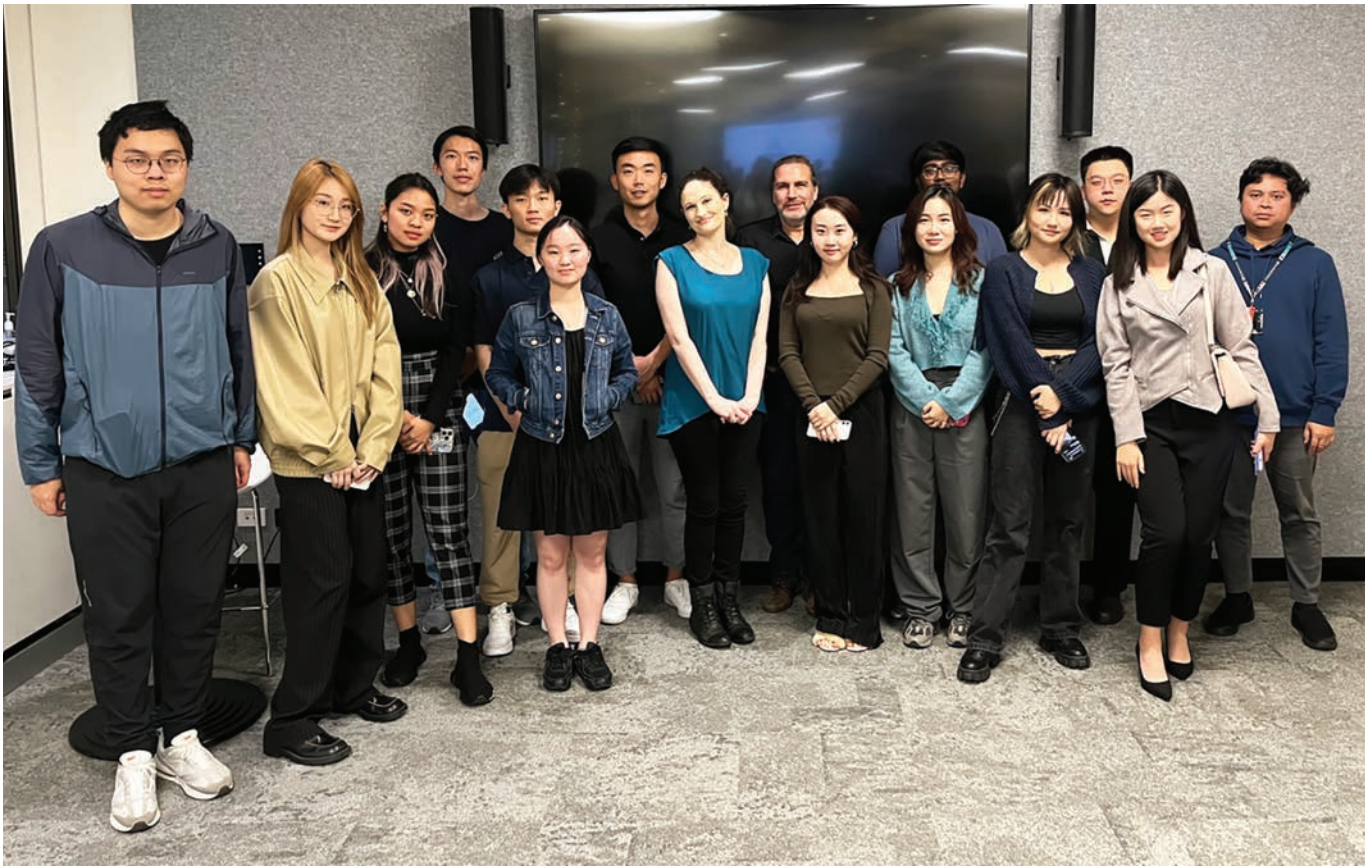
International students working with Redfern Legal Centre as part of the Study NSW Jobs Connect Six-Week Internship Business Challenge and Community.

ISLS has advocated removing Condition 8105 because unscrupulous employers exploit it, pressuring international students to work beyond the prescribed hours, knowing they risk visa cancellation. This exploitation can lead to underpayment, discrimination, bullying, and even harassment of international students, who have limited recourse due to their vulnerable visa status. Permanently removing this condition would prevent such exploitation and protect the wages and conditions of all workers.