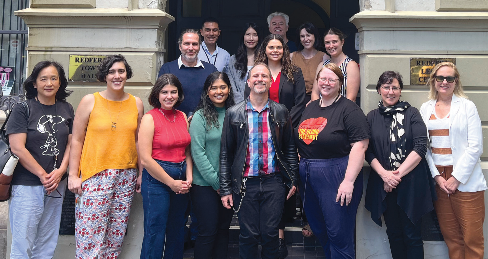
Redfern Legal Centre (RLC) staff, 2022.