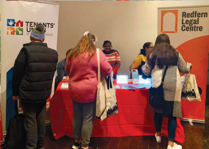
Pictured clockwise from top left: First Nations Solicitor at RedLink, June 2022; Aboriginal and Torres Strait Islander Legal Access Worker conducting outreach at Poets Corner, May 2022; RLC stall at NAIDOC in the City, July 2022; and outreach at RedLink, June 2022.