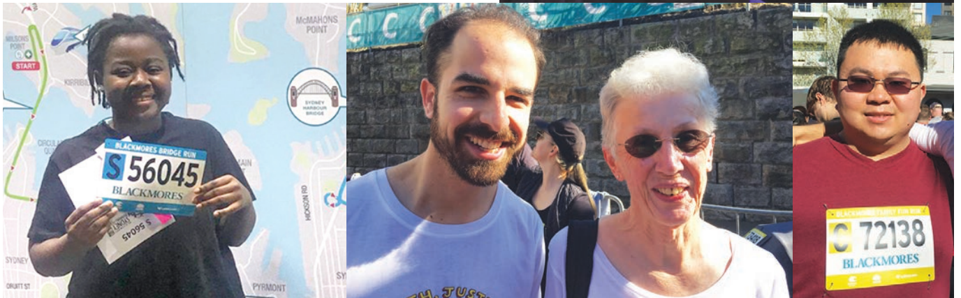
Pictured from top: YPC Co-chairs opening a financial abuse panel discussion raising funds and awareness; Big smiles from the YPC at RLC's comedy fundraiser; and RLC volunteers and staff running for justice in the Blackmores Sydney Running Festival.