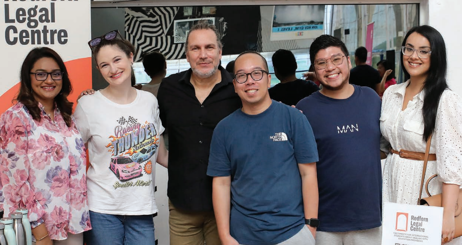
RLC's International Student Solicitor with volunteers at Australian Sports Program, April 2022.