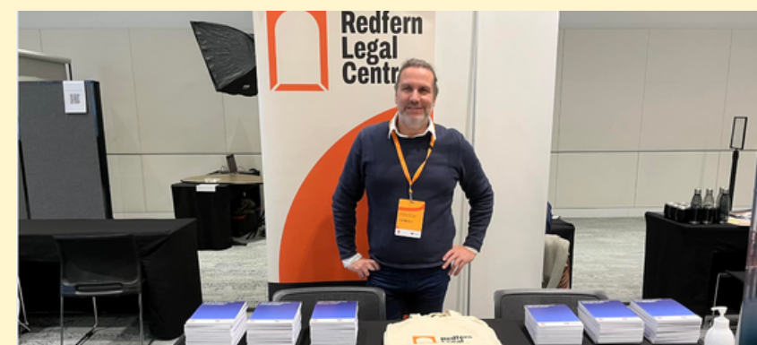
31 MAY 2023 - STUDY NSW CAREERS EXPO FOR INTERNATIONAL STUDENTS