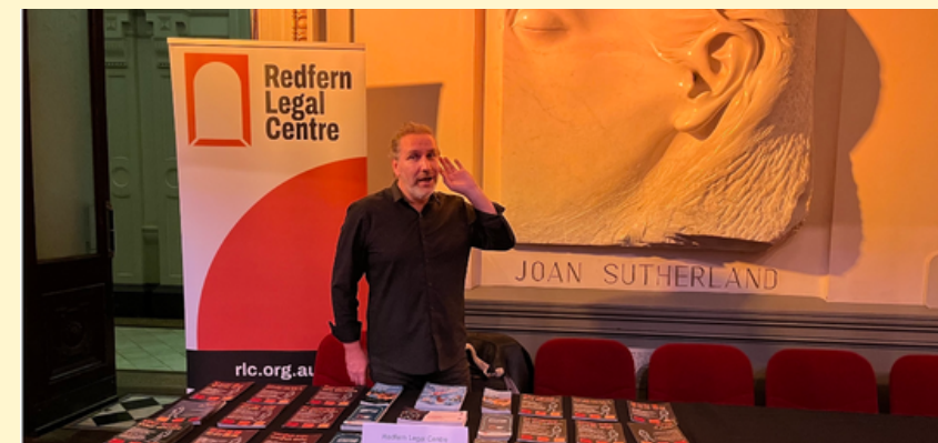
27 APRIL 2023 - LORD MAYOR'S WELCOME FOR INTERNATIONAL STUDENTS

This year, we will continue to work with international students to protect their rights, and work with government and other stakeholders to ensure systemic changes and further support are put in place for international students in NSW.